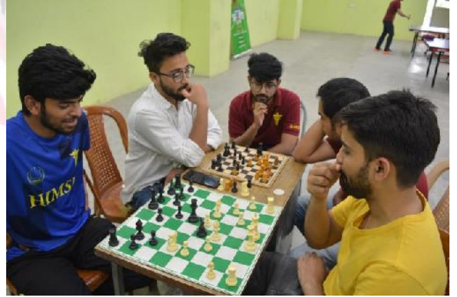
Hamdard Institute of Medical Sciences and Research Jamia Hamdard, Hamdardnagar, New Delhi - 110062