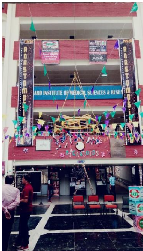
Hamdard Institute of Medical Sciences and Research Jamia Hamdard, Hamdardnagar, New Delhi - 110062