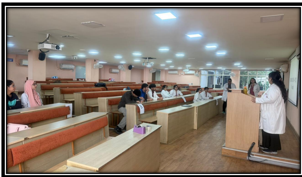
Glimpses from the college level final quiz round (25/03/2026)

The quiz aimed to enhance knowledge and awareness among students in a competitive and interactive format. The event was attended by students and post graduate students, contributing to a vibrant academic environment. The details of the winning team have been documented separately. Photographs documenting various stages of the activity have been attached.