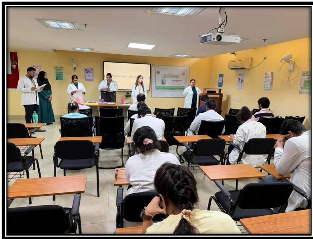
Glimpses from the preliminary quiz round (18/03/2026)