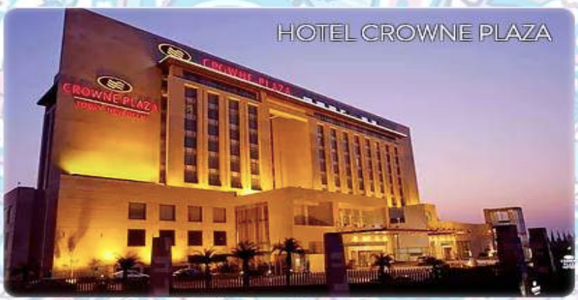
Located 3.9 Km from the Convention Centre Jamia Hamdard