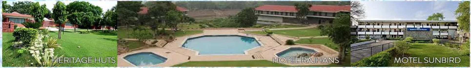
Located 6.9 Km from the Convention Centre Jamia Hamdard