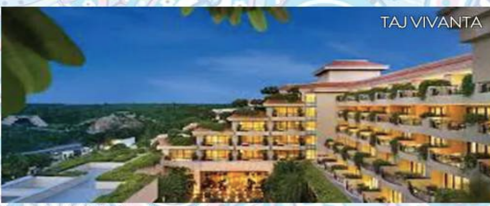
Located 6.4 Km from the Convention Centre Jamia Hamdard